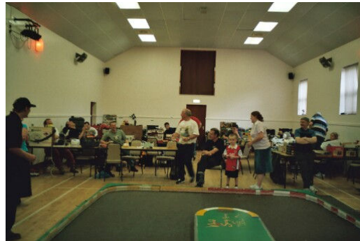
View of the hall